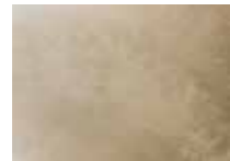
FROZEN MURANO GLASS